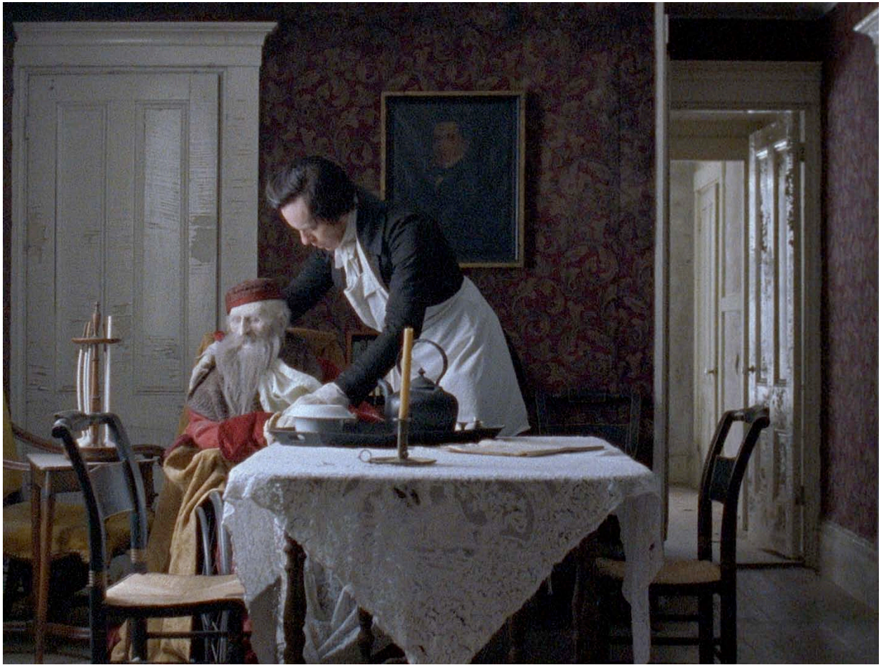
The Servant and his Master at breakfast.