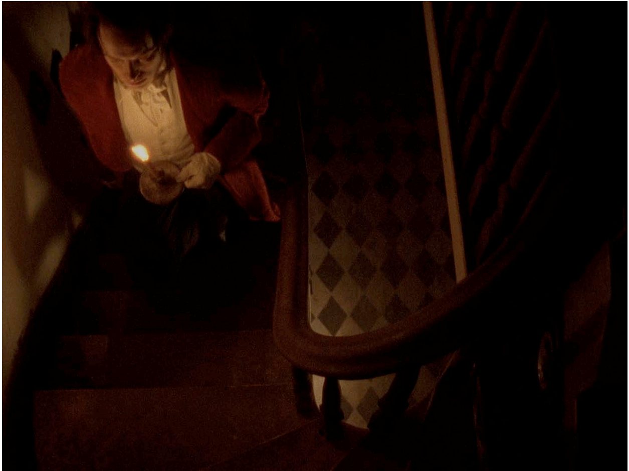
The Servant ascends the front stairwell.