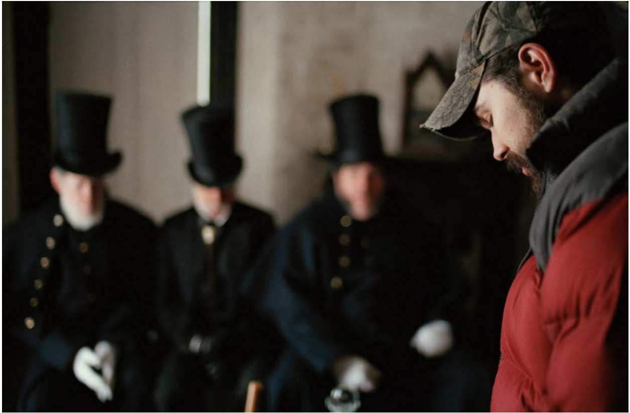
Director Robert Eggers blocks a scene.